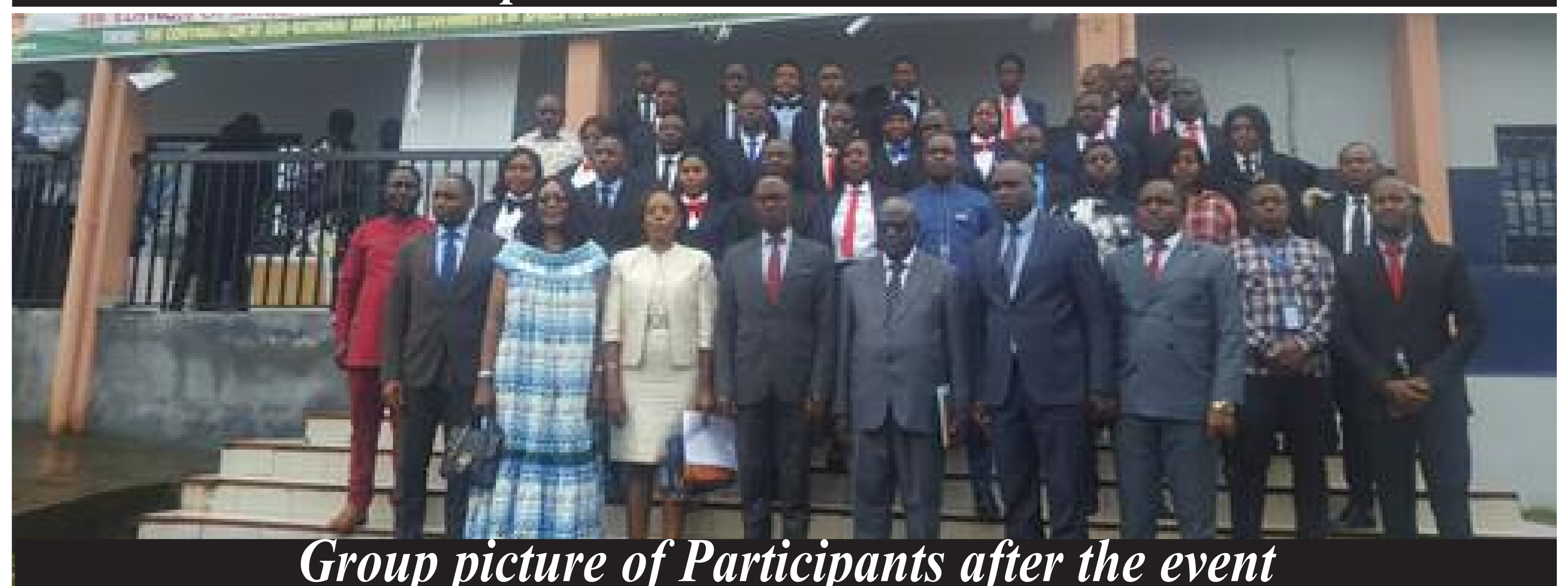
Group picture of Participants after the event

ed the role played by local, regional, and state governments in different African countries in consolidating and promoting the African Continental Free Trade Area.