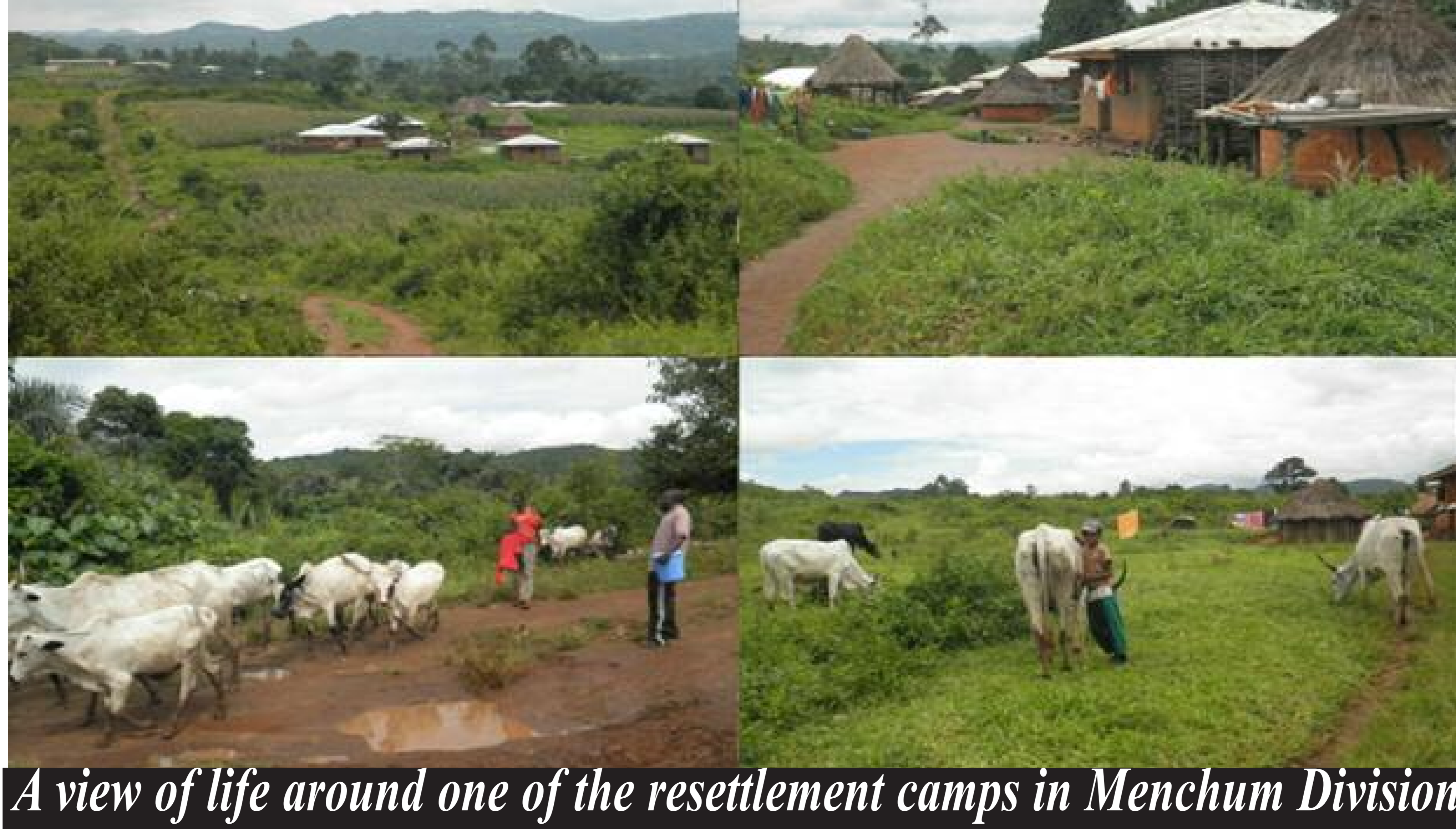
A view of life around one of the resettlement camps in Menchum Division

She continued that: "Before the Anglophone crisis began, we were expecting a giant project from the