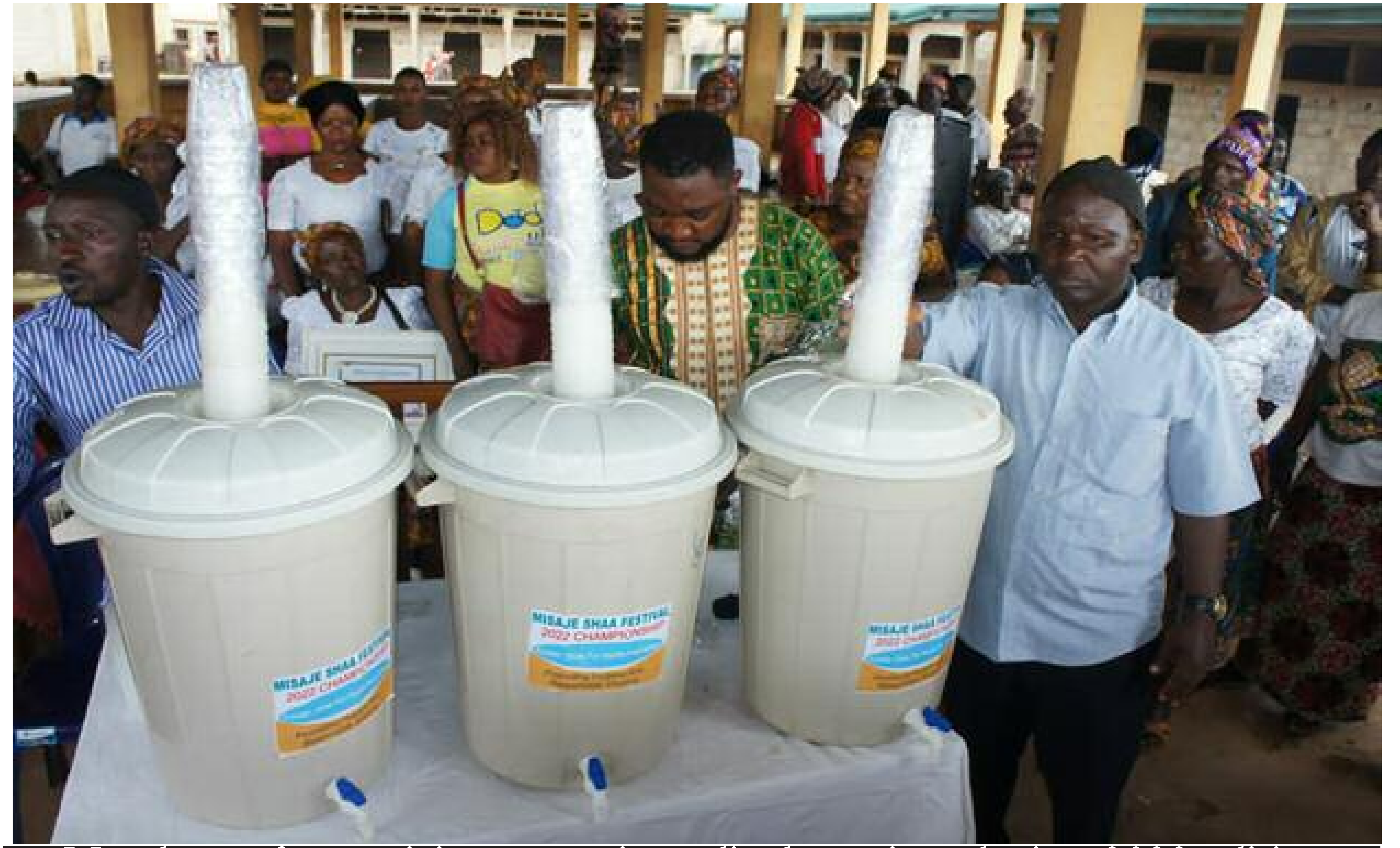
Members of organising committee display prizes during 2022 edition

took home FCFA 100,000, a bucket with running tap, and 20 cups. The second winner grabbed FCFA 75,000, a bucket with a running tap and 20 cups.