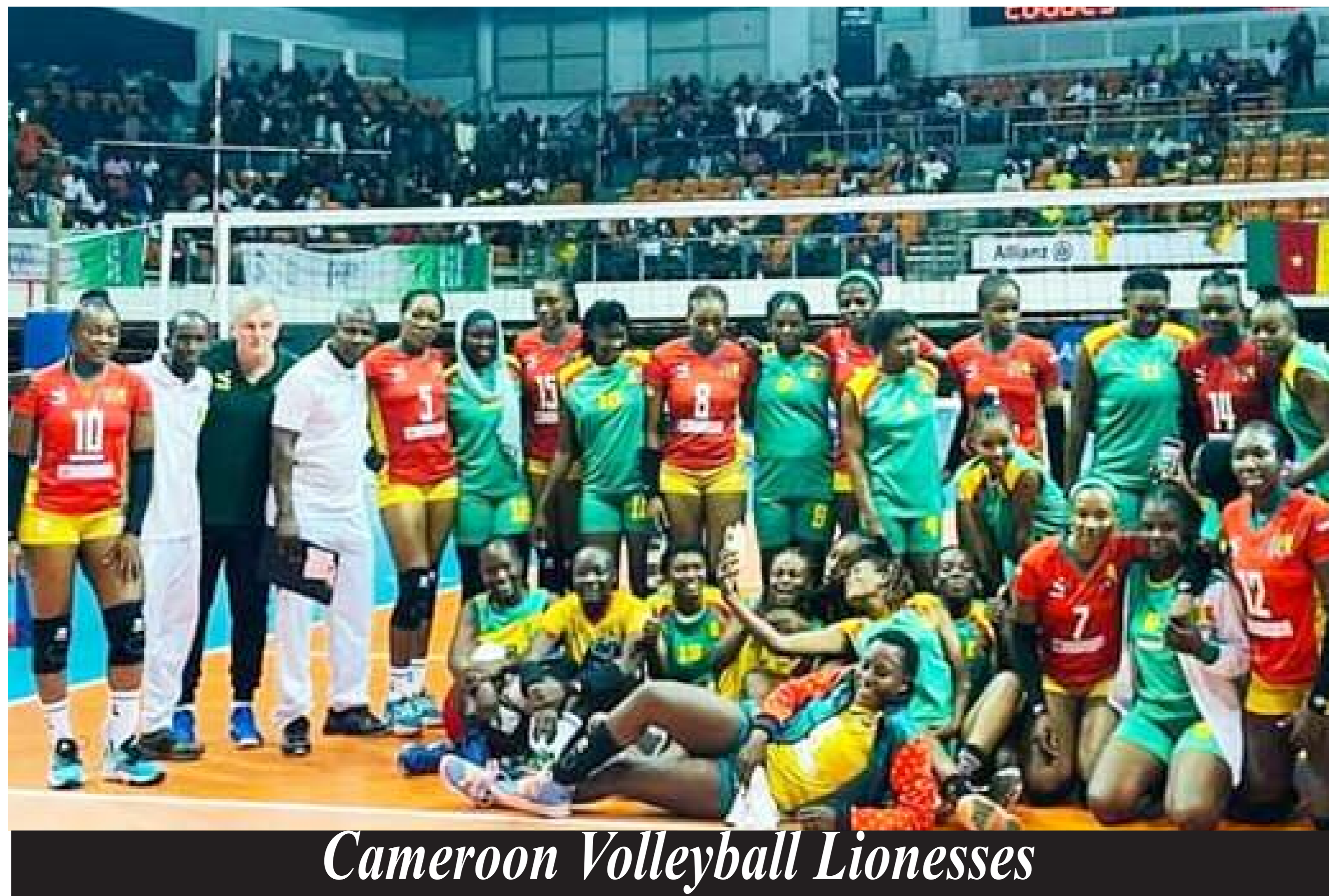
Cameroon Volleyball Lionesses

Cameroon will be facing a Moroccan team that finished third in Group B behind Kenya and Uganda.