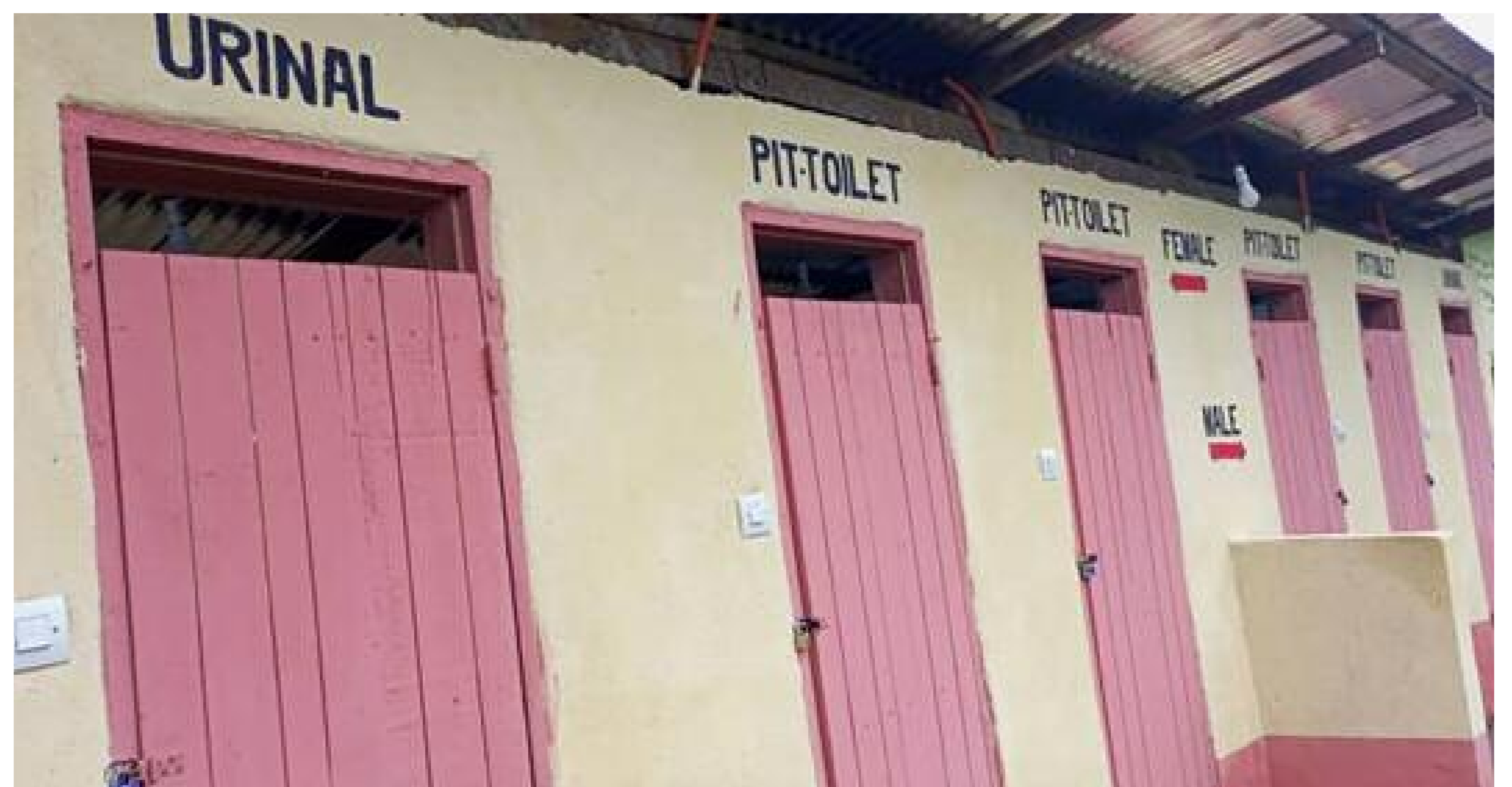
Front few of donated toilets