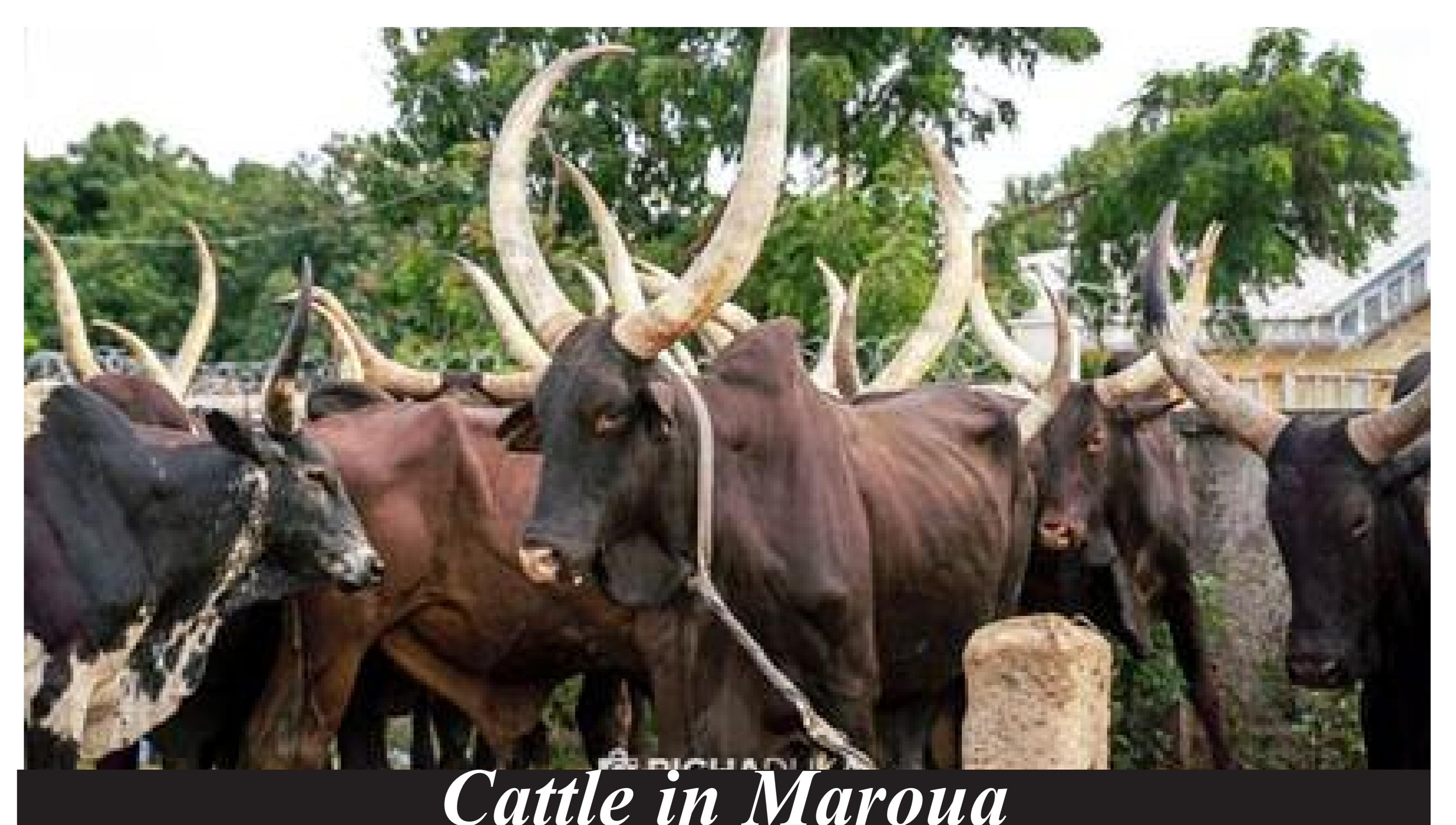
Cattle in Maroua