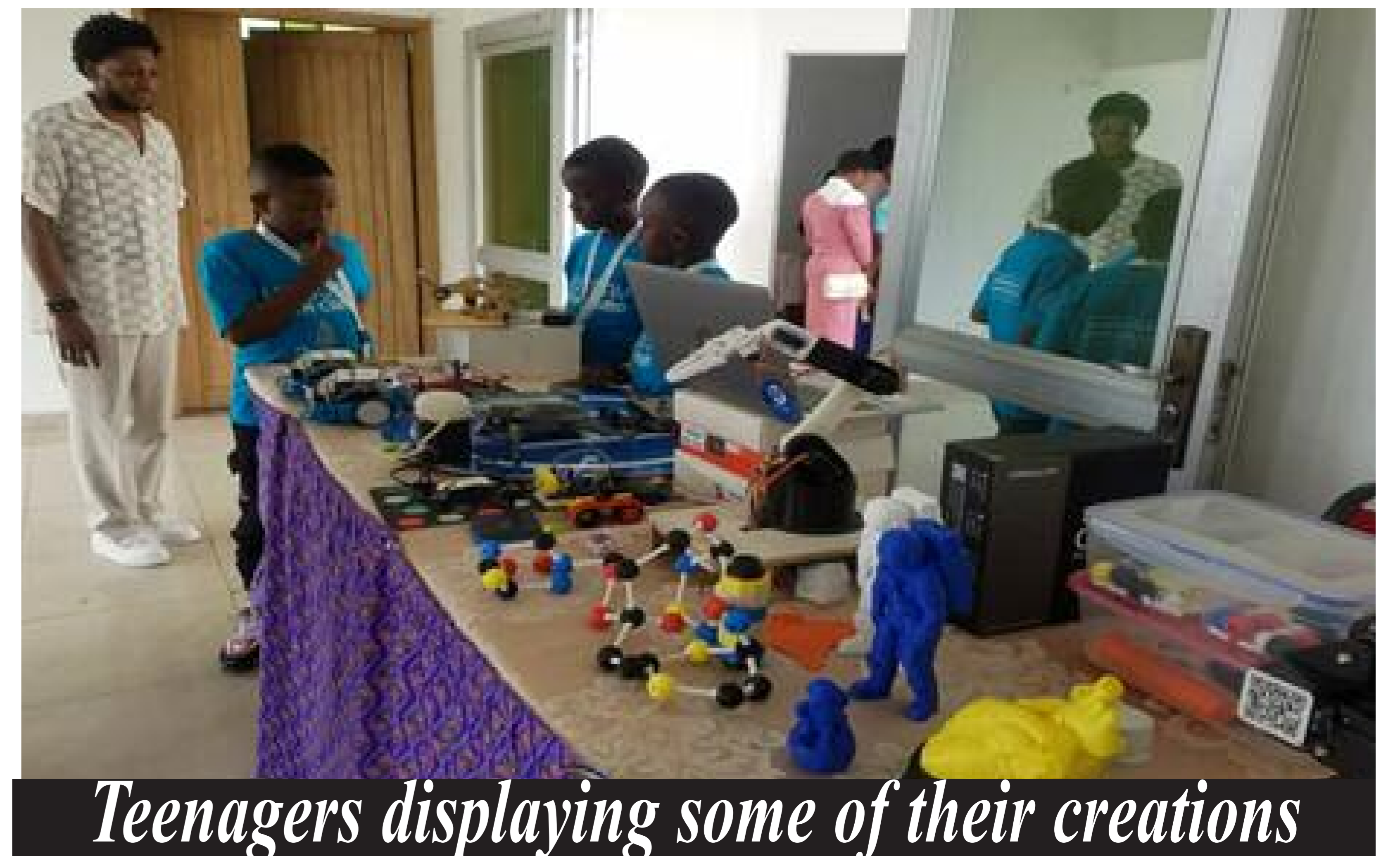
Teenagers displaying some of their creations