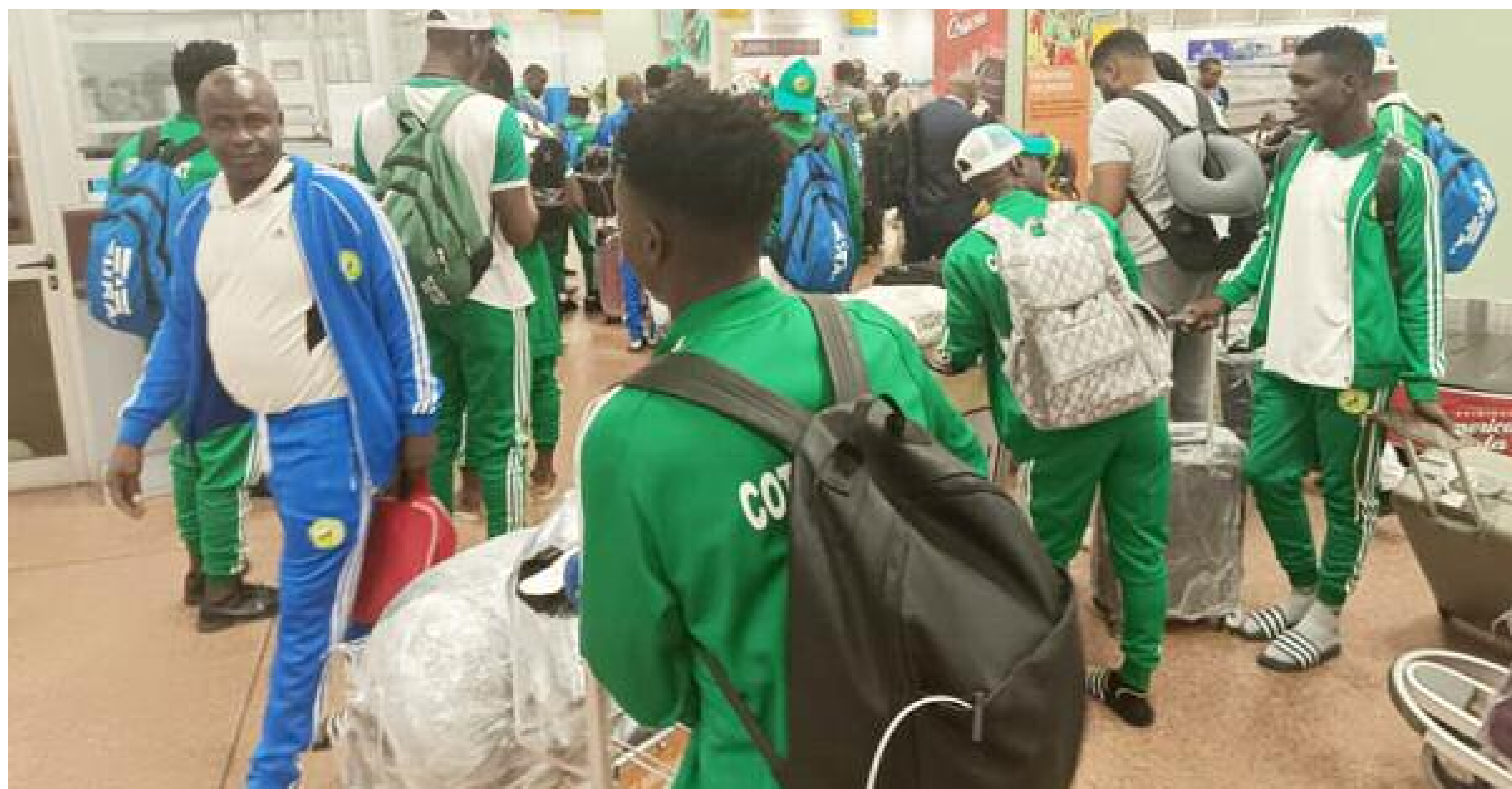
Coton Sport players, staff back in the country

Last season, they disappointingly crashed out of the continent's foremost club competition after losing all six group matches. It was their joint worst performance in their history.