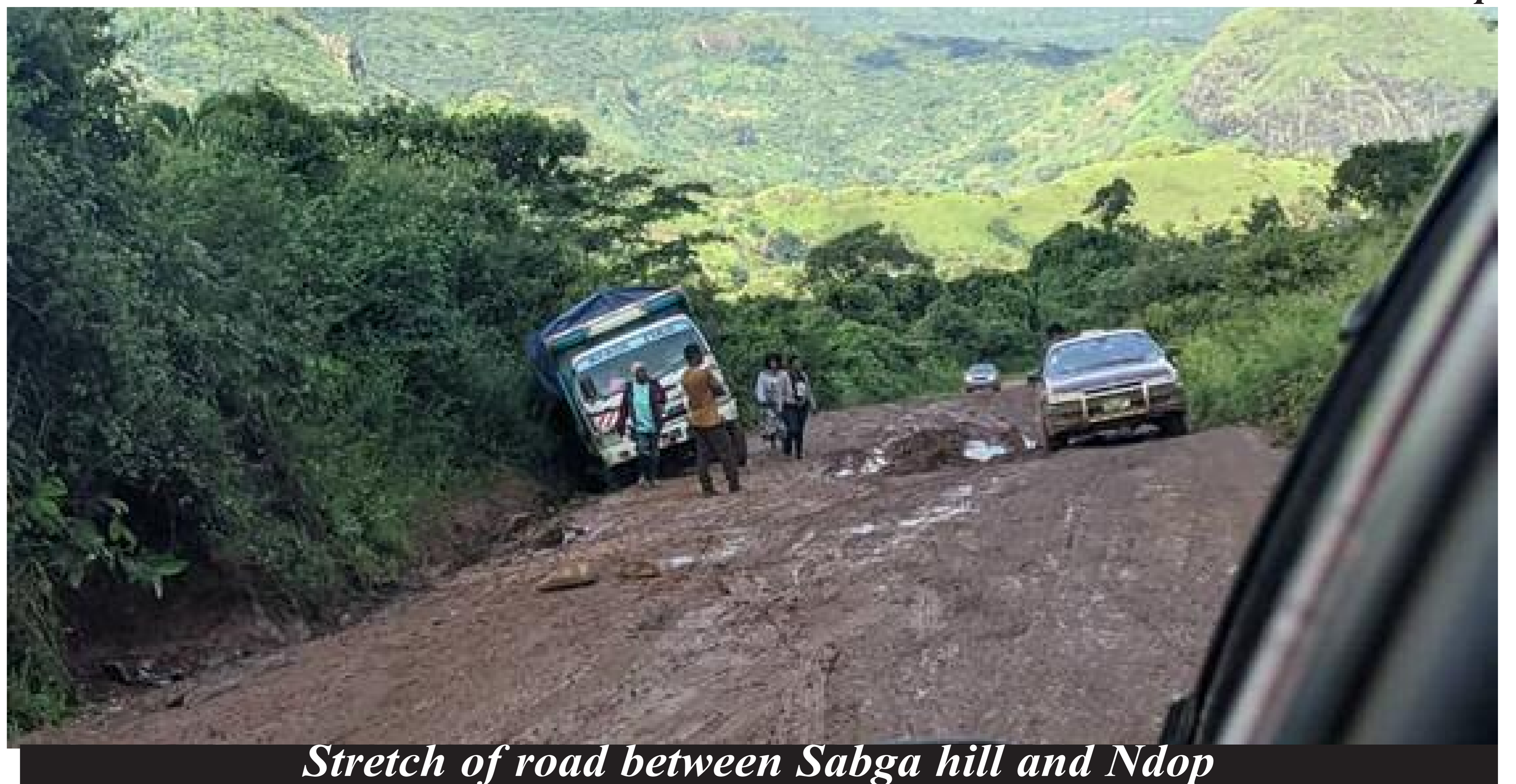
Stretch of road between Sabga hill and Ndop