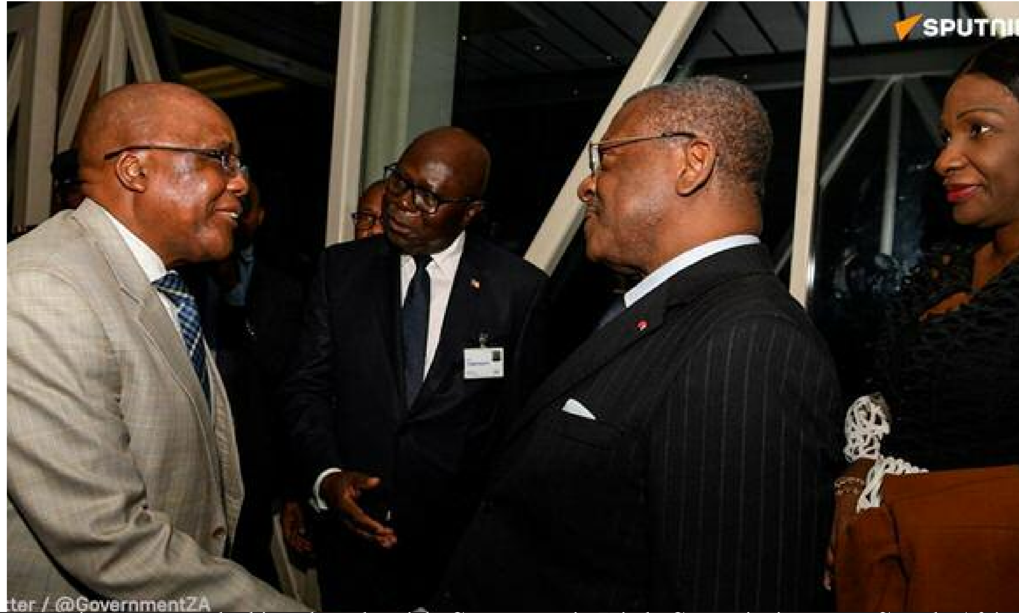
PM Dion Ngute shaking hands with Cameroon's High Commissioner to South Africa

It is being staged amid an international context cloaked in sever-