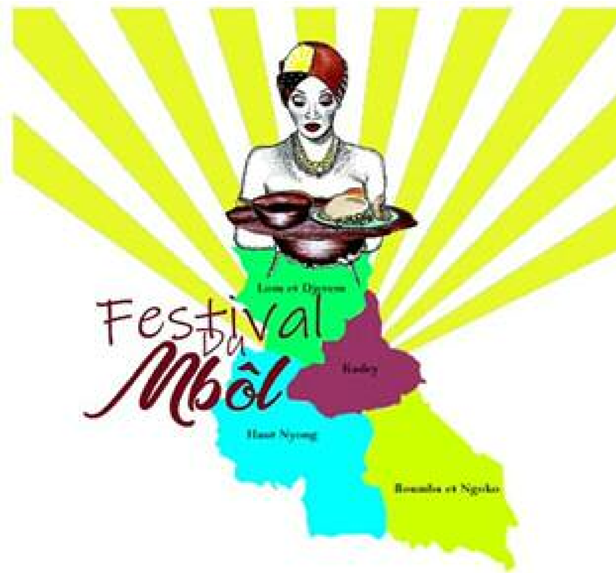
Mbol Festival logo

There were also several activities that took place during the festival. This year, economic conferences were organised as well as trainings and workshops.