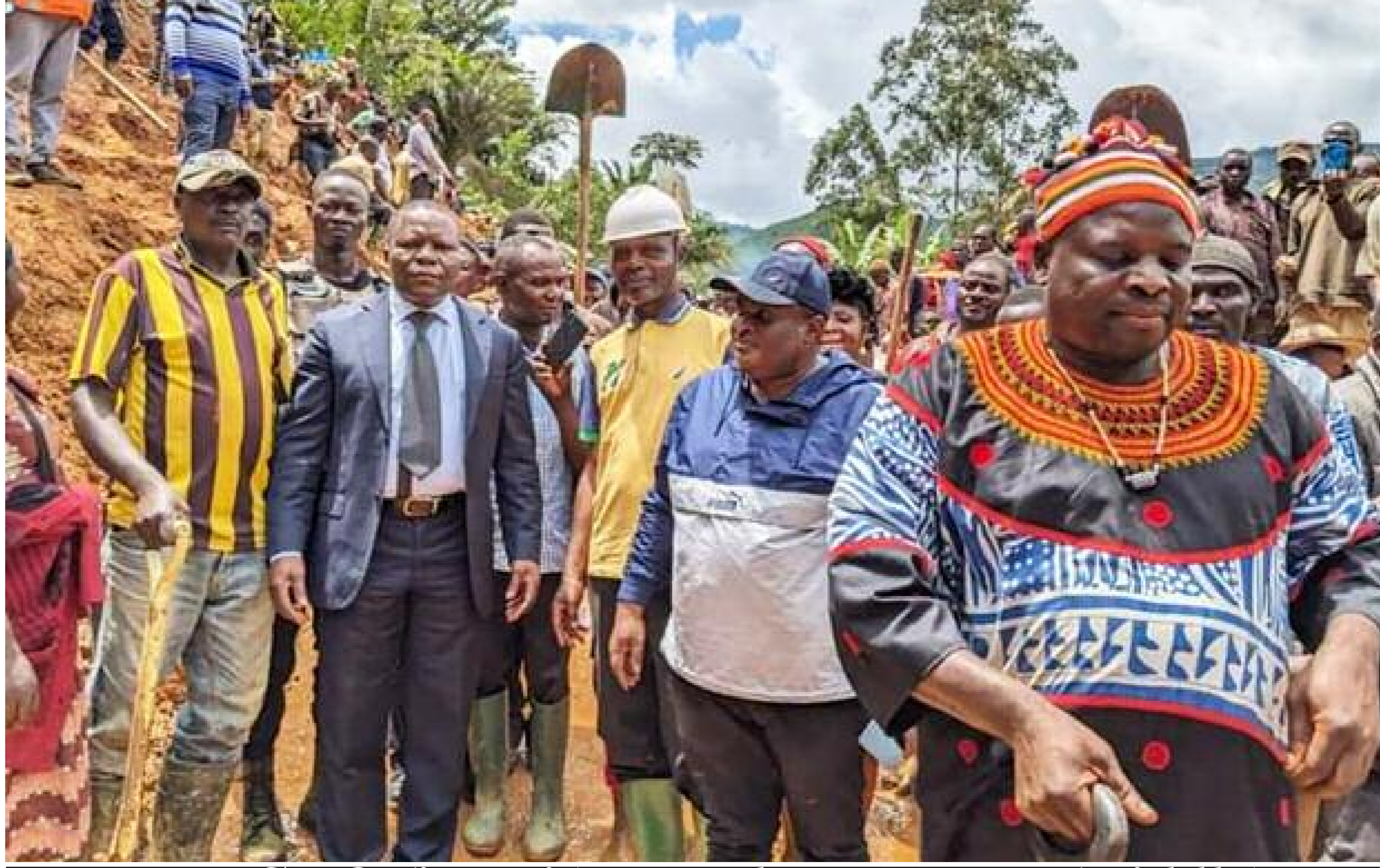
Boyo SDO (in suit), Fundong Mayor (middle), Fundong DO (second from right) at landslide scene

The joy which came with the reopening of the road months after, was cut short just hours after following the natural disaster.