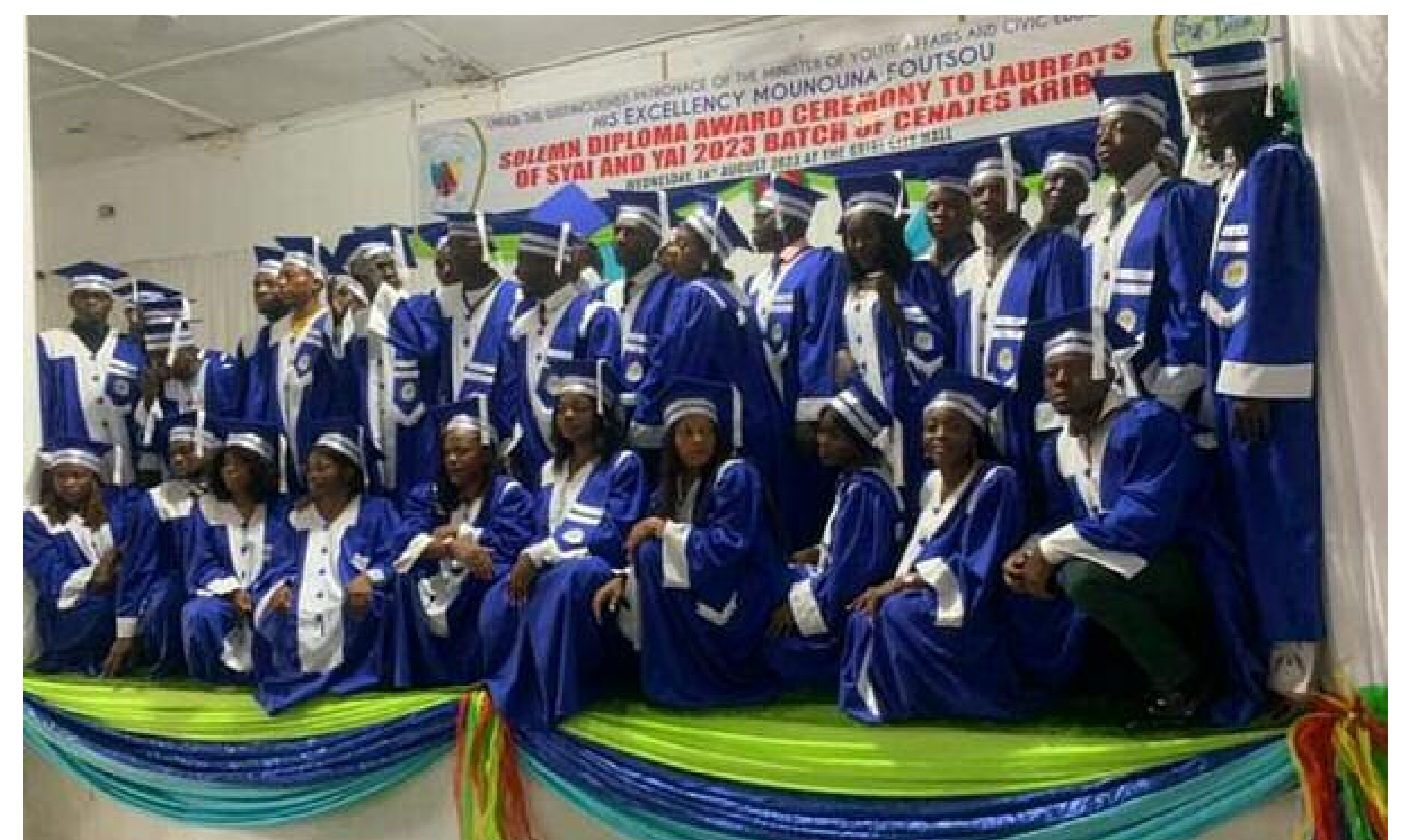
Graduates wearing robes on graduation day to mark start of new life

Going by the minister, the fresh graduates in their role as youth and action instructors