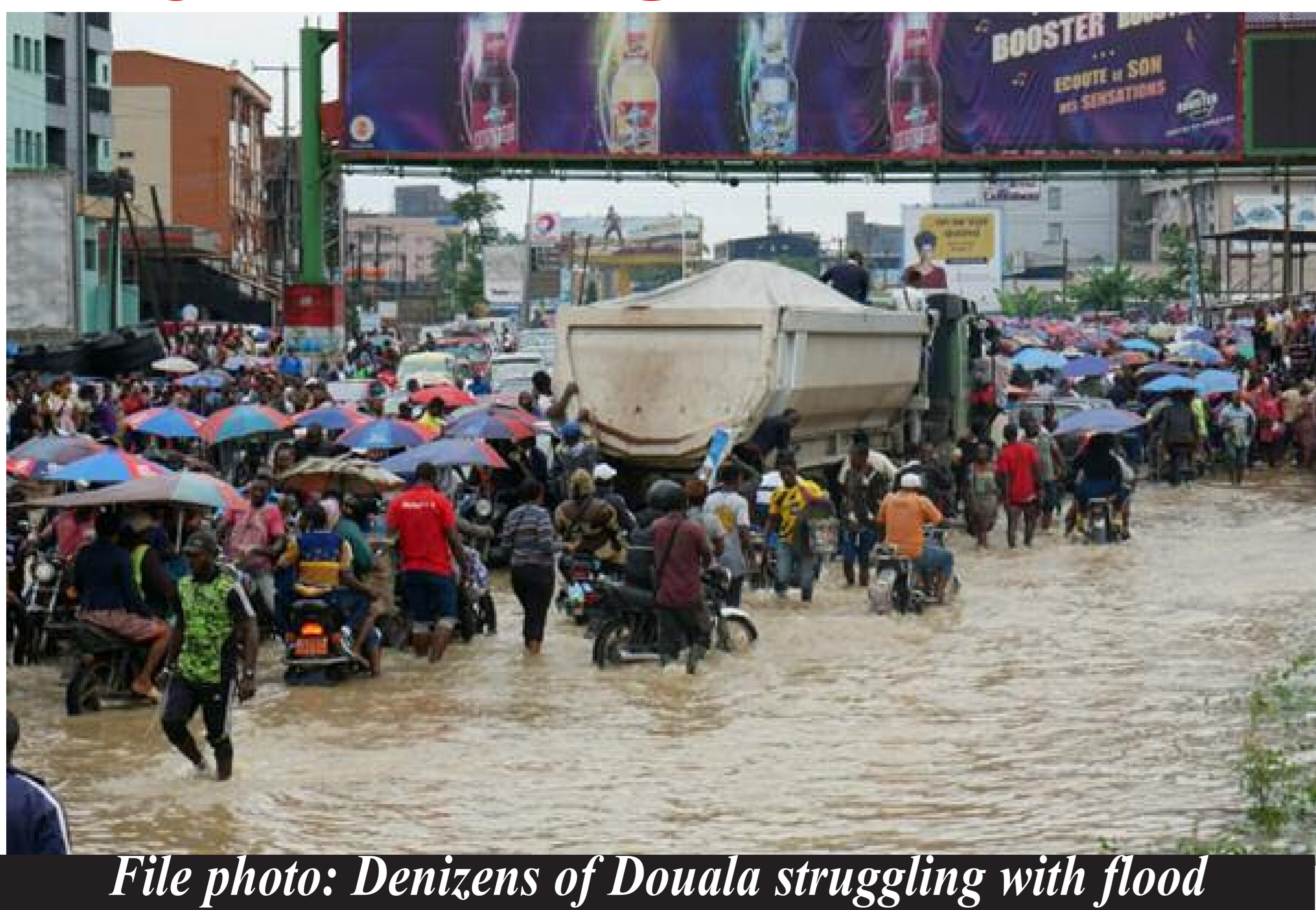
File photo: Denizens of Douala struggling with flood