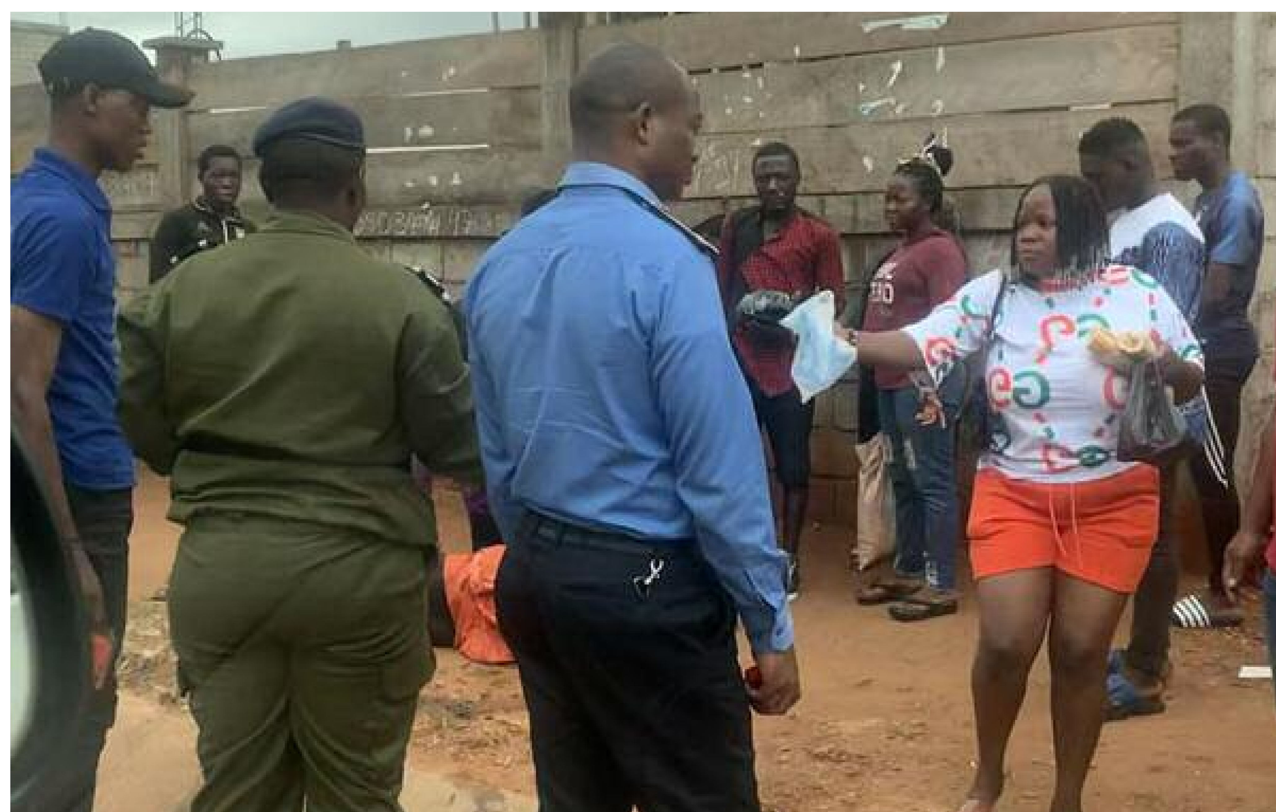
Authorities assessing the situation

No exact information filtered out as to the circumstances surrounding her death. However, information we gathered indicated that the lady reportedly had an argument with her husband which is suspected to have