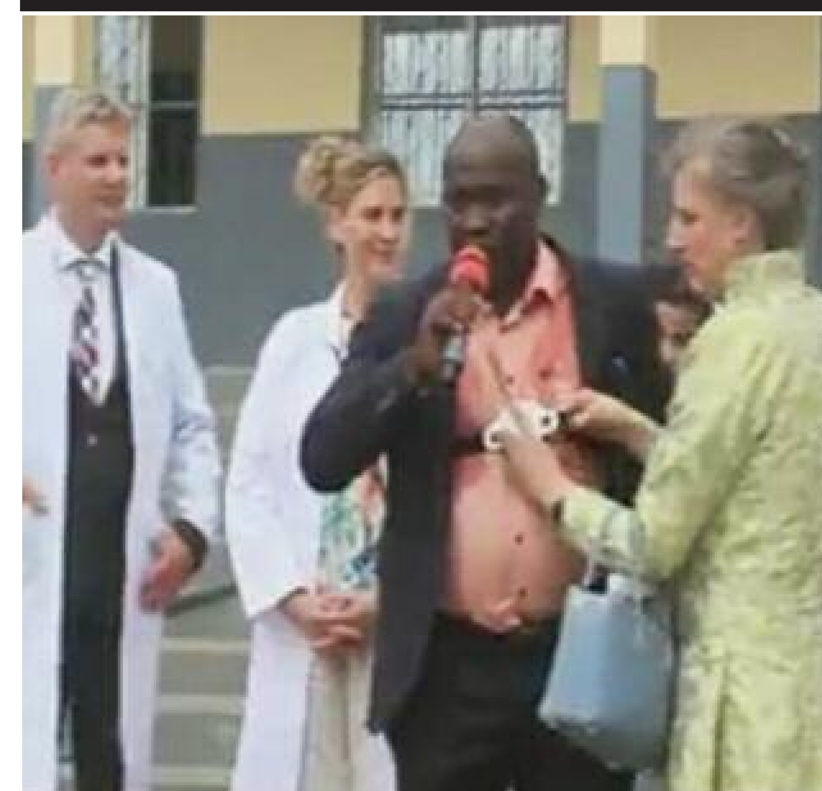
Visiting physicians demonstrating how to use digital healthcare device always be with us".