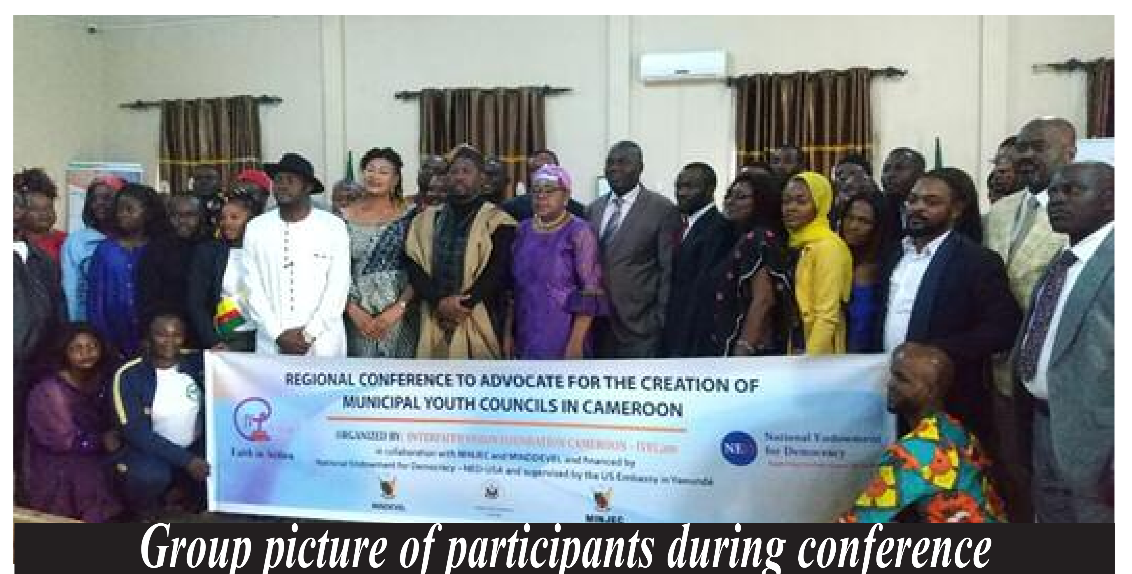
Group picture of participants during conference

The participants were partitioned into groups as they brainstormed on strategies to engage youth in decision-making, strategies that young people can be involved in monitoring and evaluation in council development projects.