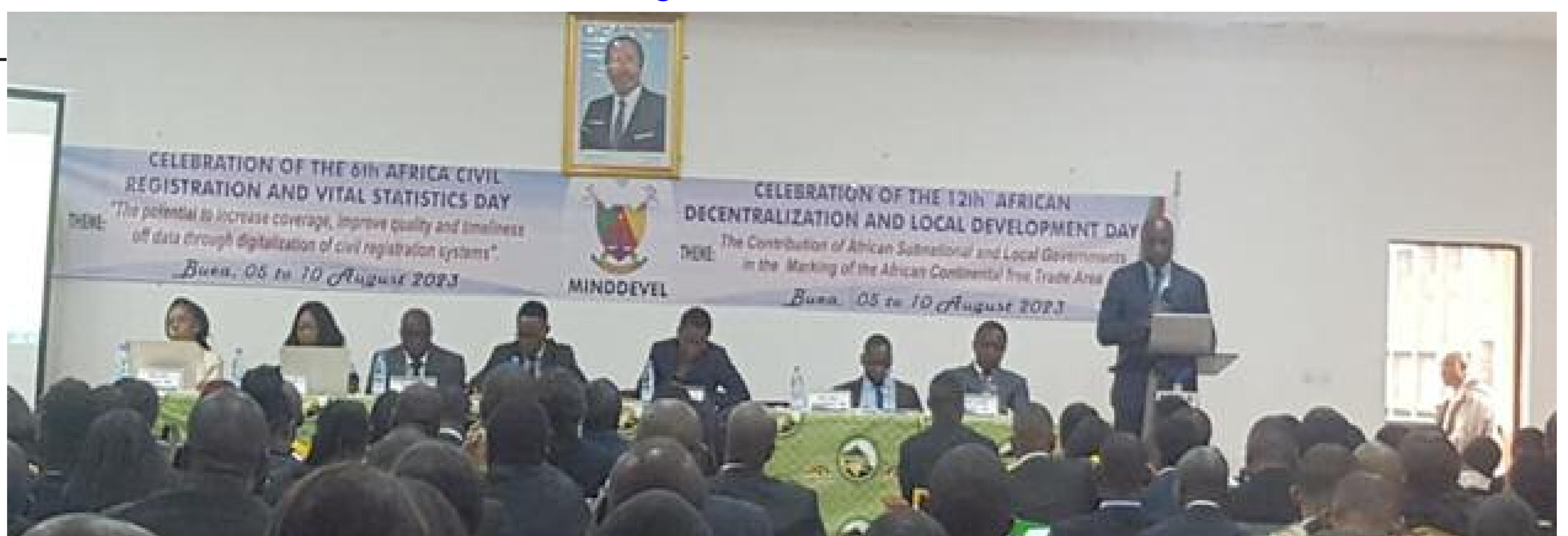
Participants at the commemorative event

During the commemoration, participants highlight-