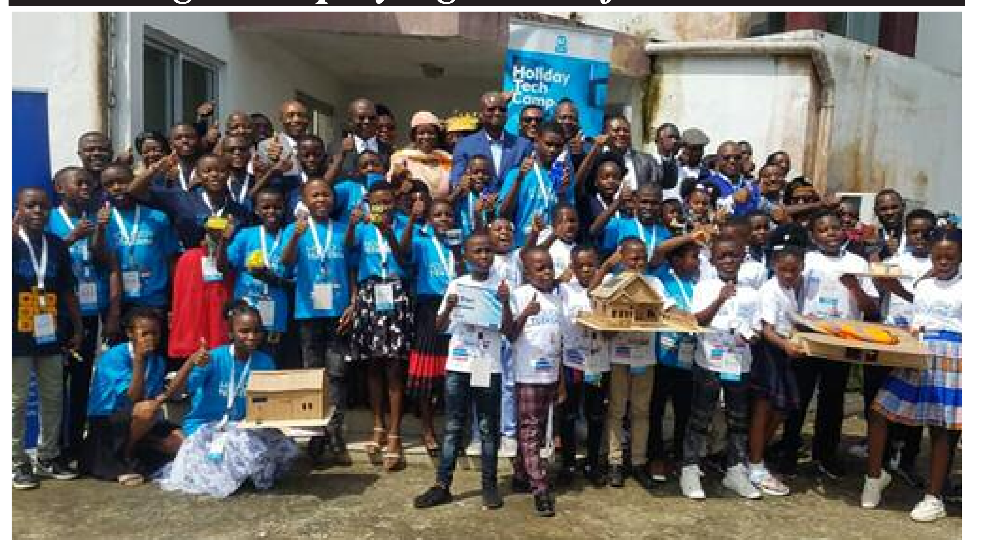
Participants after the tech camp in Buea

said he was satisfied with the training based on the response of the children in not only gaining tech skills, but other soft personal development skills.