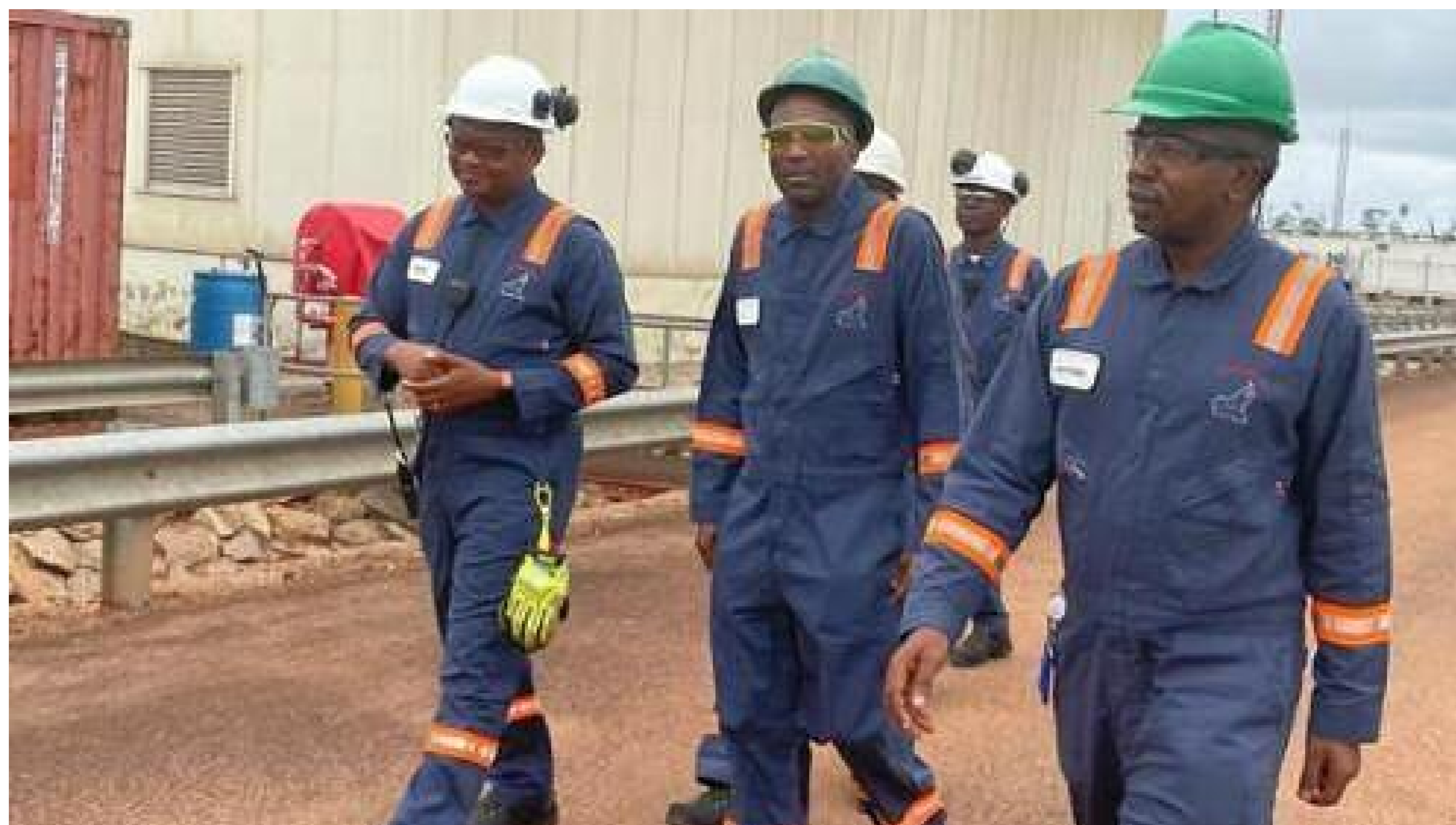
Operators on field inspection along pipeline

It is worth noting that before this development, SNH that represents Cameroon held barely 5.17% shares at COTCO.