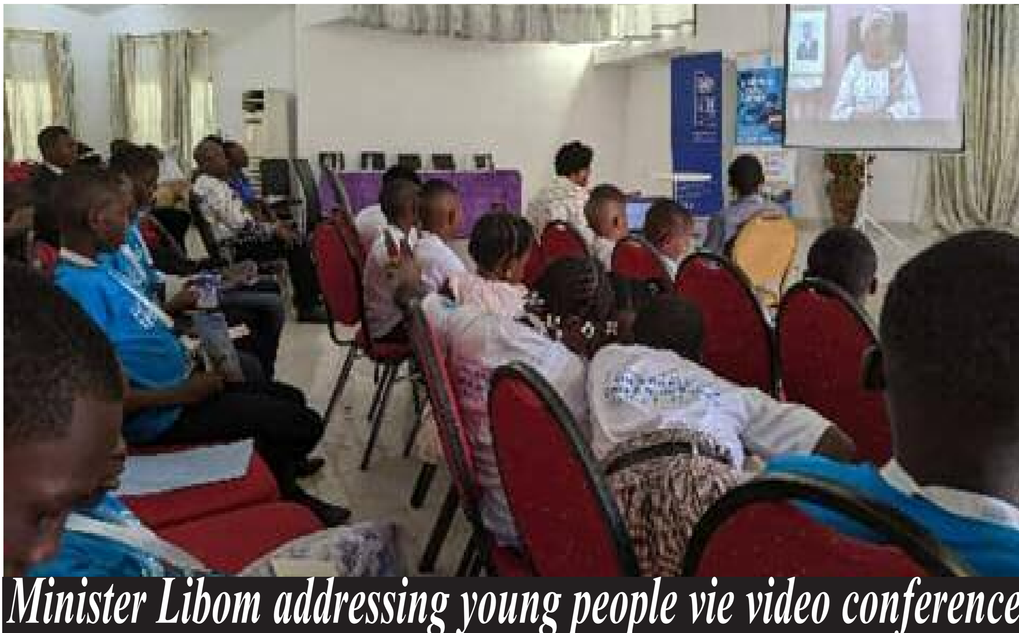
Minister Libom addressing young people via video conference

Beyond learning, it was a true transformative experience. The skills learnt will help to build an innovations focused economy".