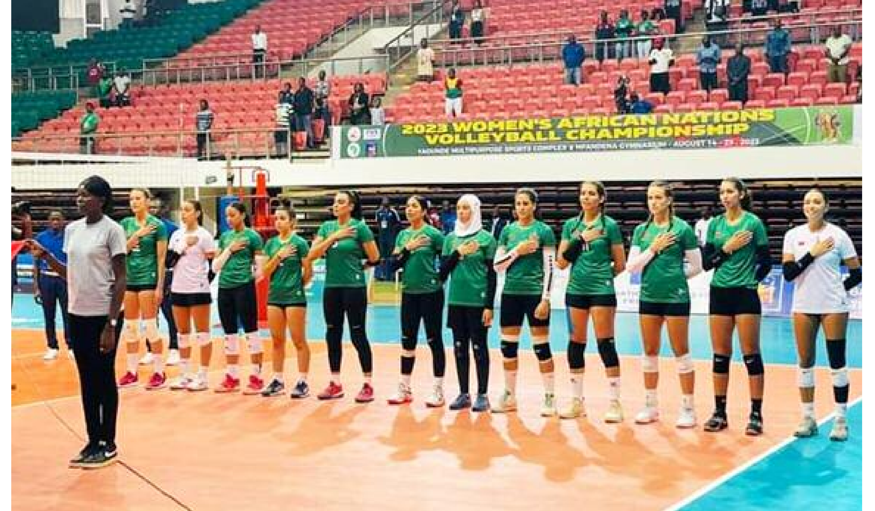
Morocco is looking to better its bronze medal record in 2021

She went on: "We are not taking any opponents for granted. We