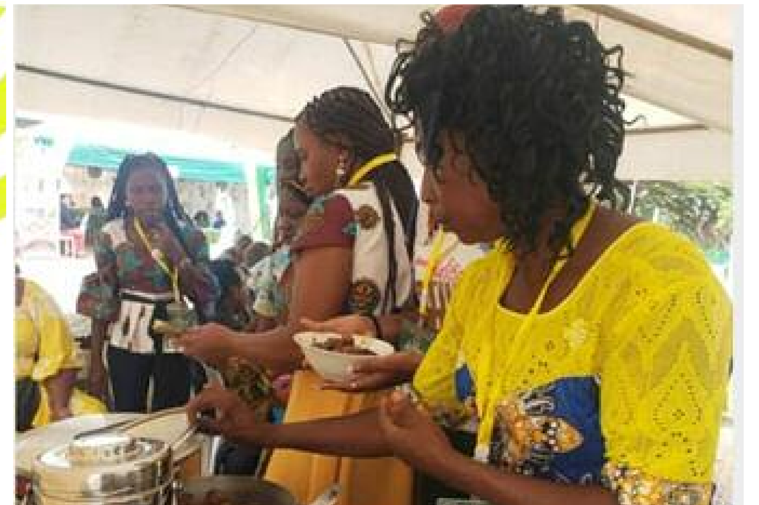
Visitors getting plates of Mbol during festival

Visitors who attended the Mbol Festival have been expressing their contentment.