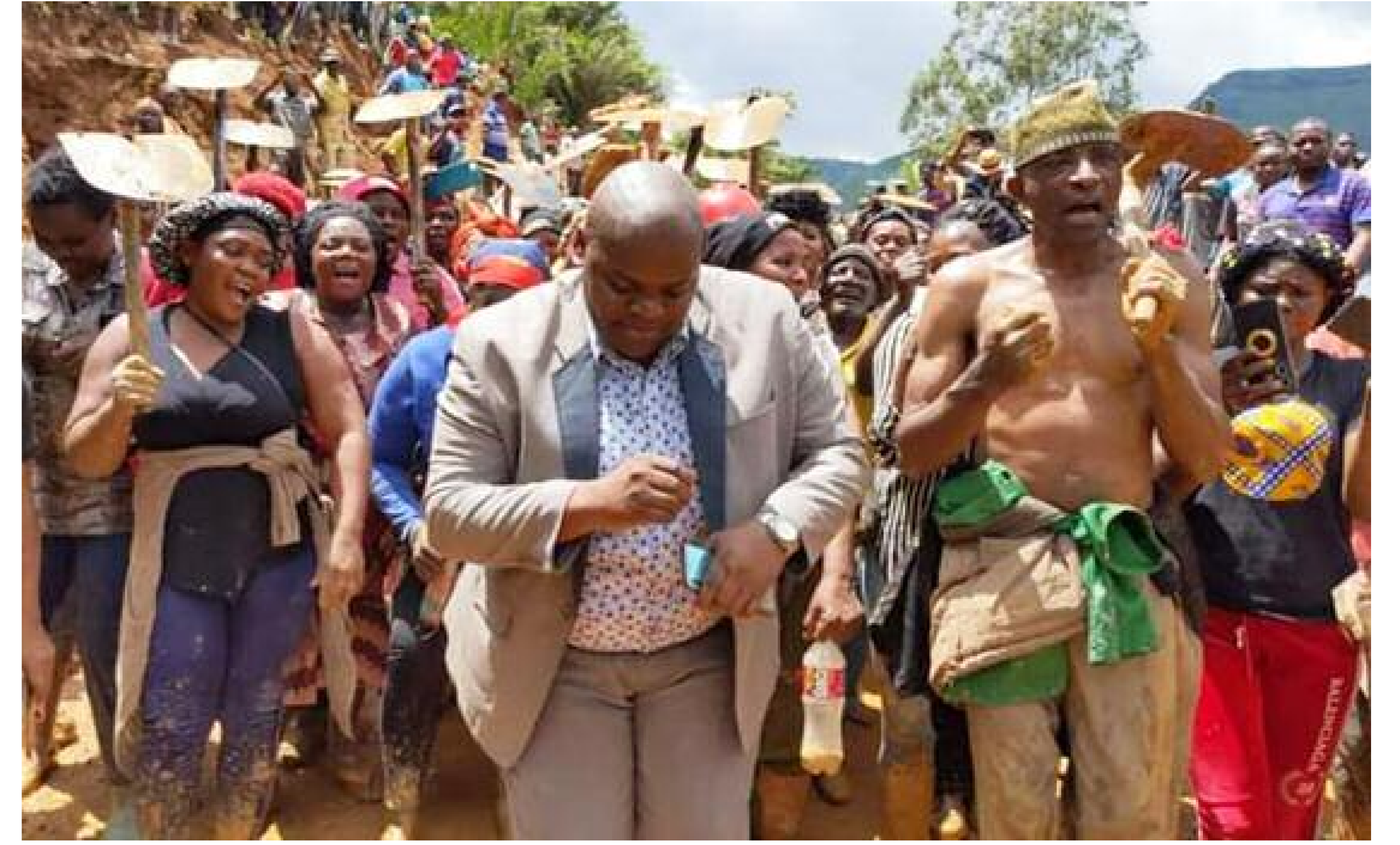
Assistant SDO dancing with population after circulation restored on Fundong-B'da road